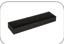
VT DUO Case

Audio Bauer Pro AG, Bernerstrasse-Nord 182, CH-8064 Zürich, Switzerland Phone: +41 44 432 32 30, Fax: +41 44 432 65 58, Email: info@vt-switzerland.com