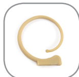
Flexible Ear Fastener