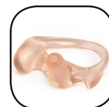
Flexible Ear Insert